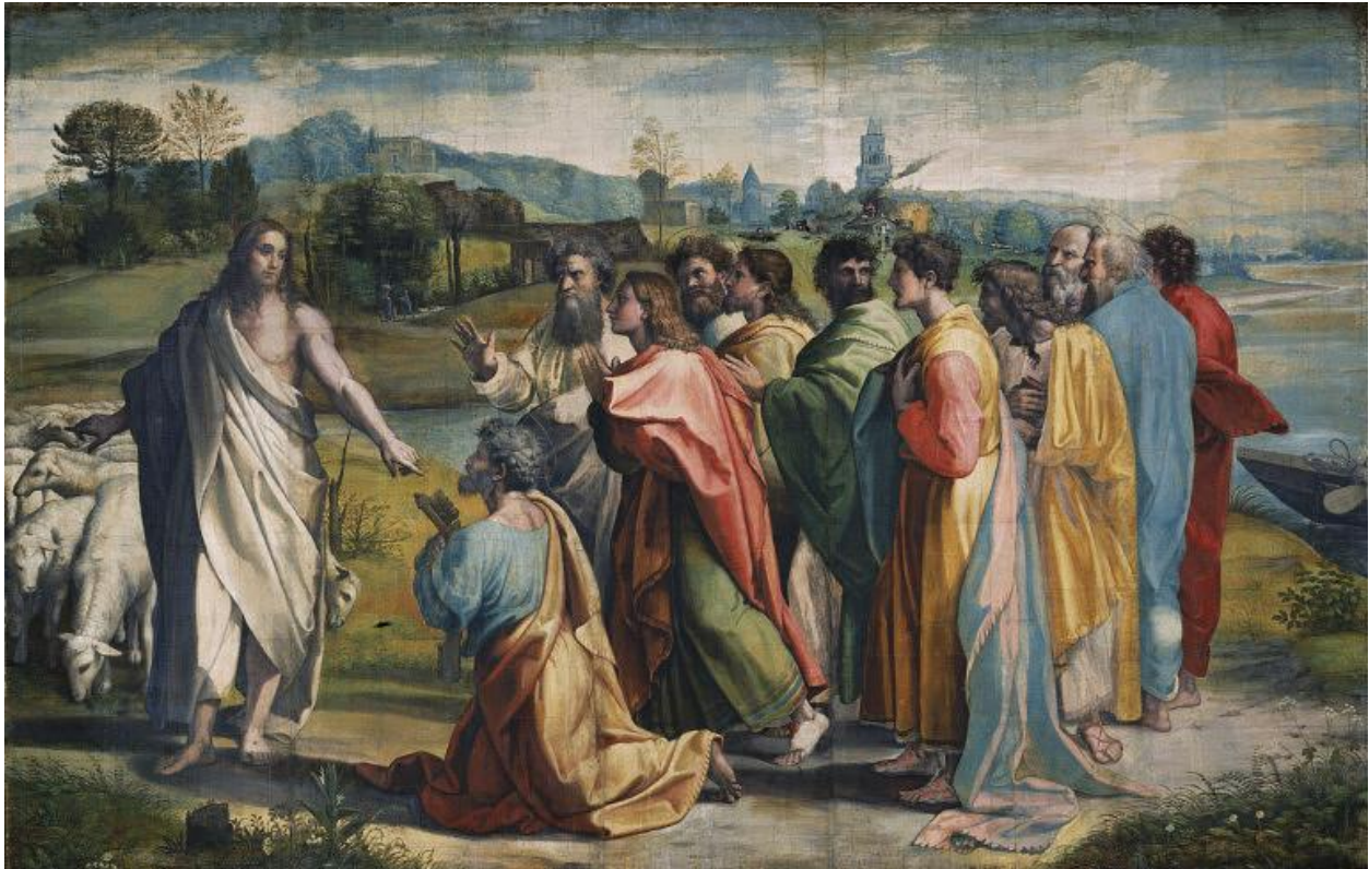
“Christ’s Charge to Peter” by Raphael (1515)

Callaway Gardens Pine Mountain, Georgia October 16-18, 2015